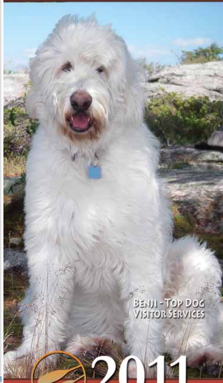
BENJI - TOP DOG VISITOR SERVICES